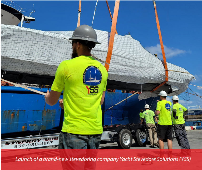
Launch of a brand-new stevedoring company Yacht Stevedore Solutions (YSS)